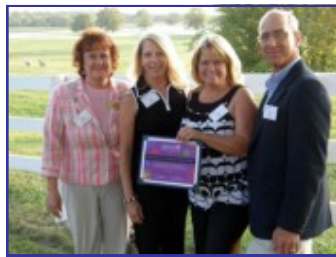
CREW Executive Committee members receive a Basic Human Needs Award from The Lake County Community Foundation

In 2009, CREW was informed that it would receive a $45,000 community development block grant from Lake County for 2010. This funding amount was a dramatic increase from the previous year's $30,000 and was provided as a direct result of the